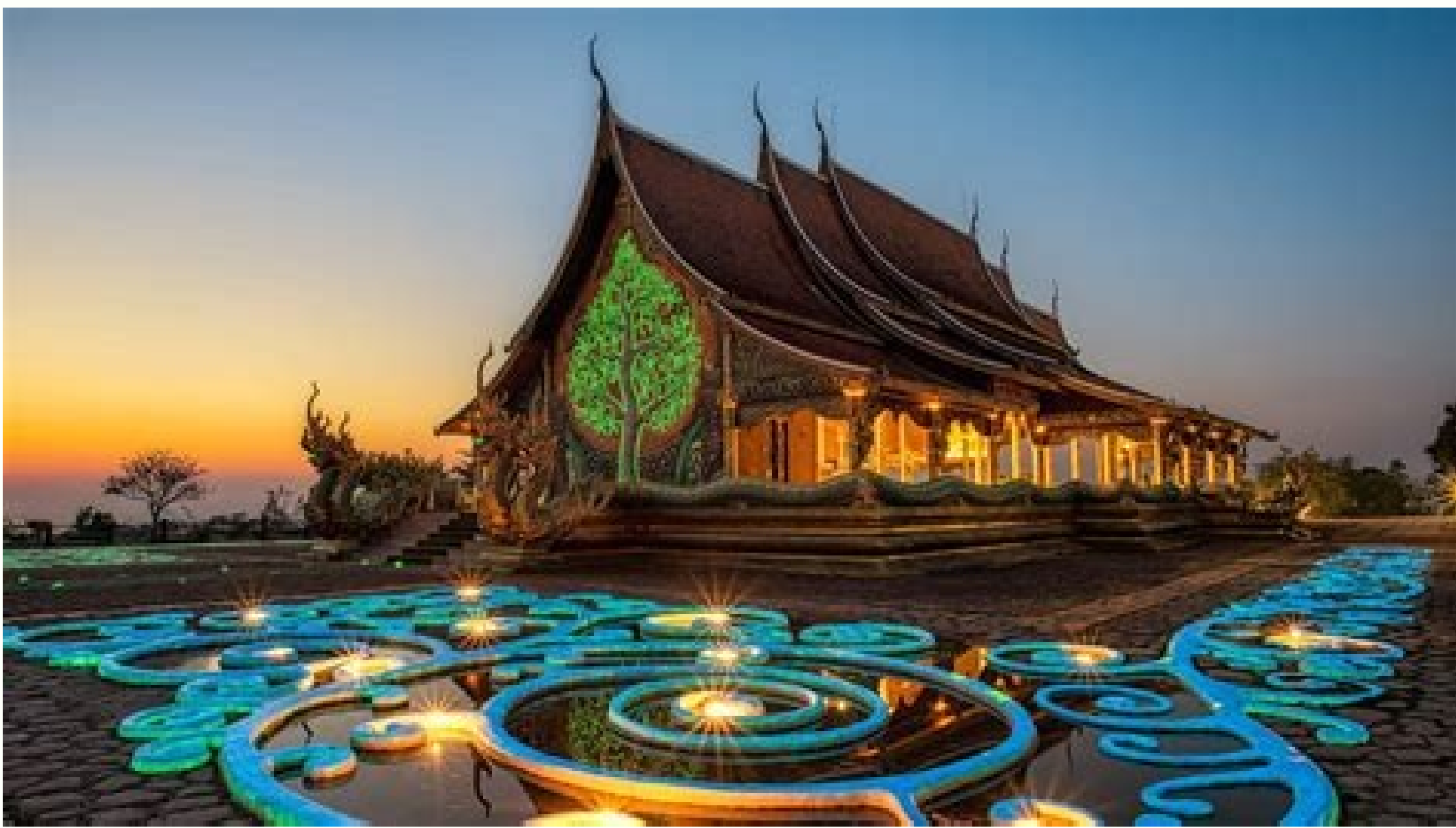
Buddha temple images hd. Lord buddha temple images. Thailand buddha temple images. Sri lanka buddha temple images. Buddha temple dehradun images. China buddha temple images. Buddha gaya temple images. Nepal buddha temple images.